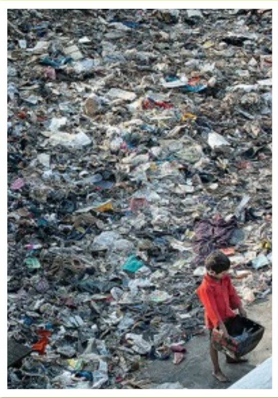
1st Place: Jeugenijs Bujanovs. Trash Dump