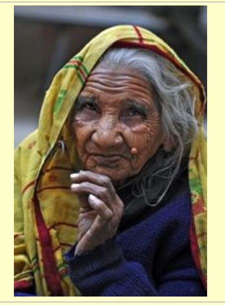
Delhi Smoke Break