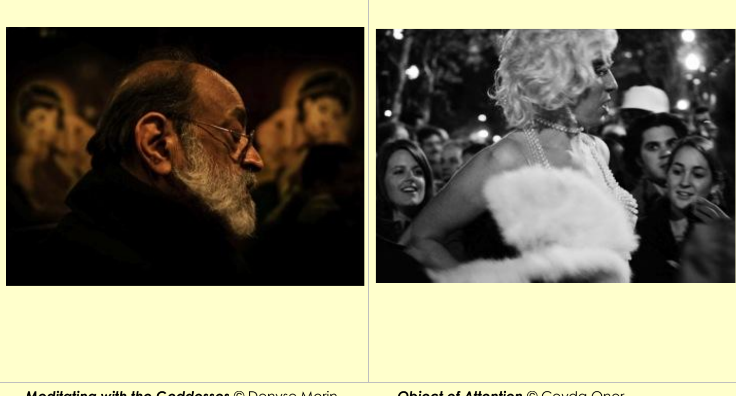
Meditating with the Goddesses