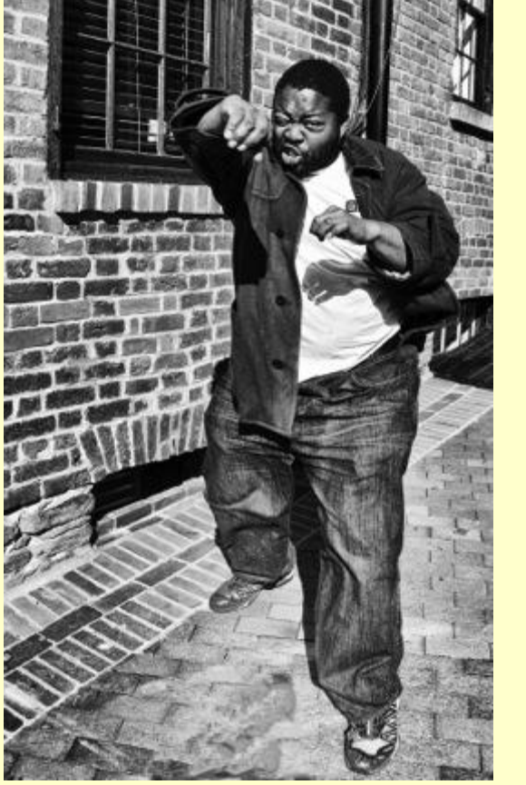
Flight Delay