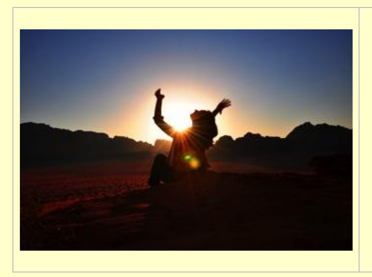
Sunset II © Stephan Eggli