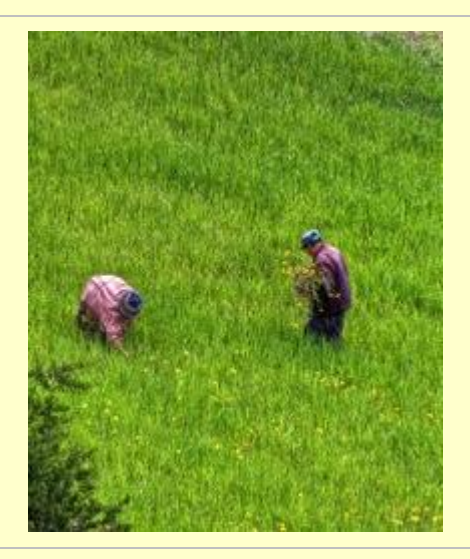
Harvest © Carmen Machicado