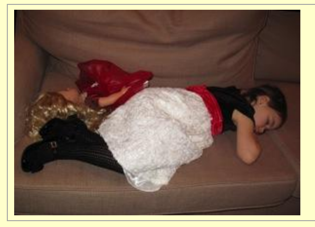
Baby and Doll © Sena Eken