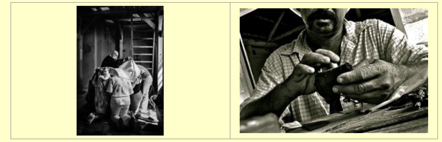
Praying for Health